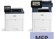
C500 43 ppm C505 43 ppm