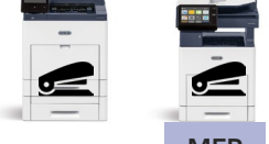
B610 63 ppm B615 63 ppm