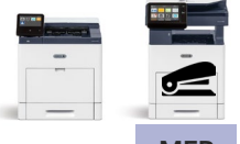
B600 55 ppm B605 55 ppm