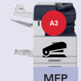
B8145/55/70 45/55/70 ppm