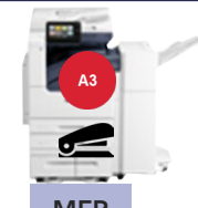
B7135 35 ppm