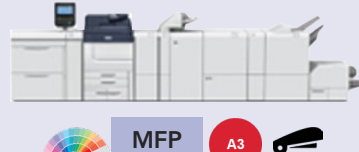
C9065/70 65/70 ppm

Small to medium work-teams, branch offices or convenience A4