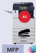
C8130/45/55/70 30/45/55/70 ppm