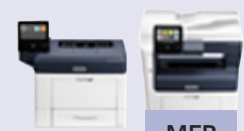
B400 45 ppm B405 45 ppm