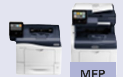
C400 35 ppm C405 35 ppm