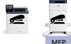
C600 55 ppm C605 55 ppm