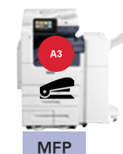
C7130 30 ppm