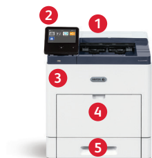
Xerox® VersaLink® B600 Printer Print.