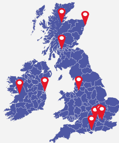
- Map of Xeretec's office locations